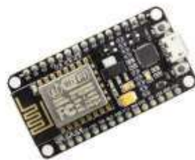
Fig: NodeMCU Development Board

NodeMCU is an open source LUA based firmware developed for ESP8266 wifi chip. By exploring functionality with ESP8266 chip, NodeMCU firmware comes with ESP8266 Development board/kit i.e. NodeMCU Development board. Since NodeMCU is open source platform, their hardware design is open for edit/modify/build. NodeMCU Dev Kit/board consist of ESP8266 wifi enabled chip. The ESP8266 is a low-cost Wi-Fi chip developed by Espressif Systems with TCP/IP protocol. For more information about ESP8266, you can refer ESP8266 WiFi Module. There is Version2 (V2) available for NodeMCU Dev Kit i.e. NodeMCU Development Board v1.0 (Version2) , which usually comes in black colored PCB.