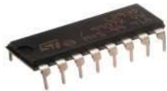
Fig 3.22: L293D IC

All inputs are TTL compatible. Each output is a complete totem-pole drive circuit, with a Darlington transistor drop and a pseudo-Darlington source. Drivers are changed in pairs, with drivers 1 and 2 enabled near 1,2EN and drivers 3 and 4 enabled by 3,4EN. When an enable input is high, the linked drivers are enabled and their outputs are active and in phase with their inputs. When the enable input is low, those drivers are disabled and their outputs are off and in the high-impedance state. With the thoroughly data inputs, each pair of drivers forms a full-H (or bridge) reversible drive suitable for solenoid or motor applications. On the L293, international high-speed output clamp diodes should be used for inductive transient stifling. A VCC1 terminal, classify from VCC2, is provided for the logic inputs to minimize device power dissolution. The L293 and L293D are characterized for operation from 0°C to 70°C.